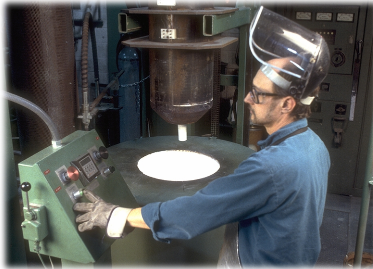
Figure 1. Countergravity casting of MMCs at Hitchiner's Nonferrous Division, O'Fallon, Missouri.

Cast metal matrix composite (MMC) materials satisfy these needs; they are reinforced metals, combining the features of metallic materials and ceramics. An aluminum alloy composite, like Duralcan's F3S.30S material, is reinforced with 30% silicon carbide particles. The material is readily melted and cast into complex geometries, meeting the requirements of machine designers with minimal post-cast processing to produce finished components.